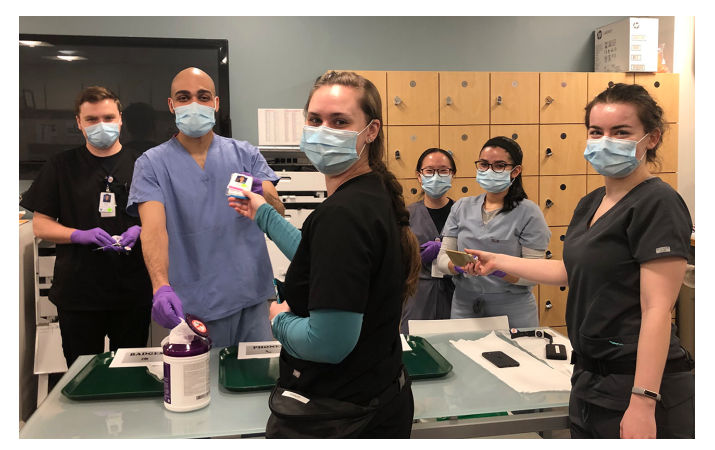
PT aides clean ID badges, Voalte phones, personal phones, and common areas to preserve PPE and keep the area COVID-free.