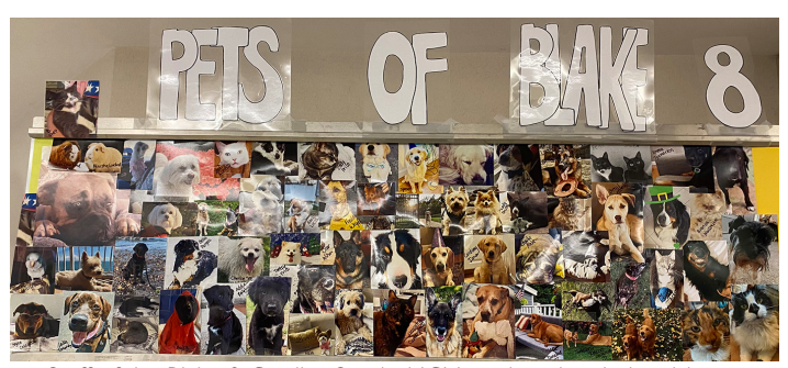
Staff of the Blake 8 Cardiac Surgical ICU are keeping their spirits up by virtually bringing their pets to work.