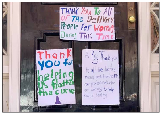
A grateful community shows it appreciation

In appreciation for your selfless work and dedication during these extraordinary times