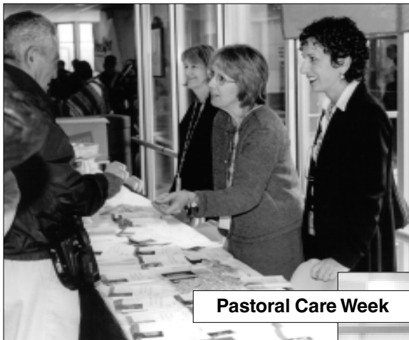
Pastoral Care Week