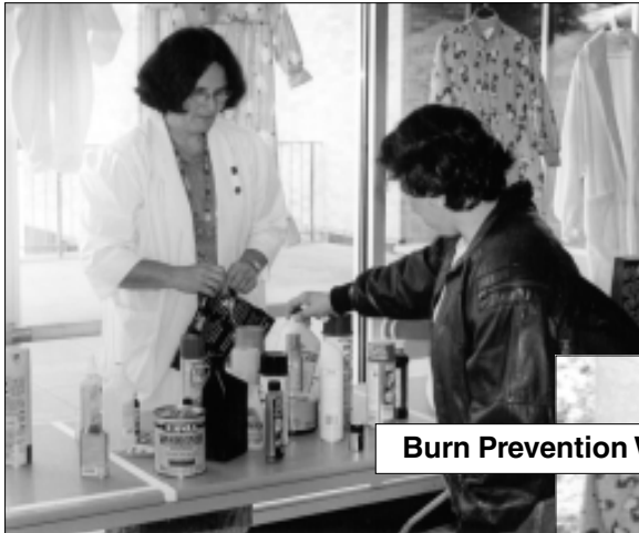
Burn Prevention Week

Burn Prevention Week and Pastoral Care Week observances October 7–11, 2002