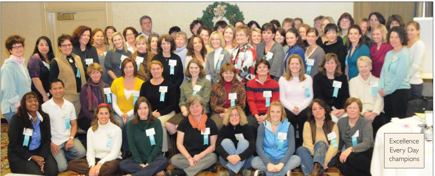
Scenes from Patient Care Services' Excellence Every Day Champions Retreat, held December 4, 2008. See Jeanette Ives Erickson's column on page 2 for more details.