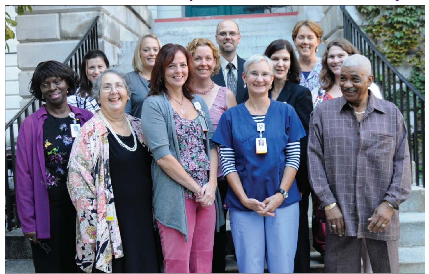
This year's Patient Care Services 'stars.' See complete story on page 4.

Patient Care Services' first annual awards ceremony