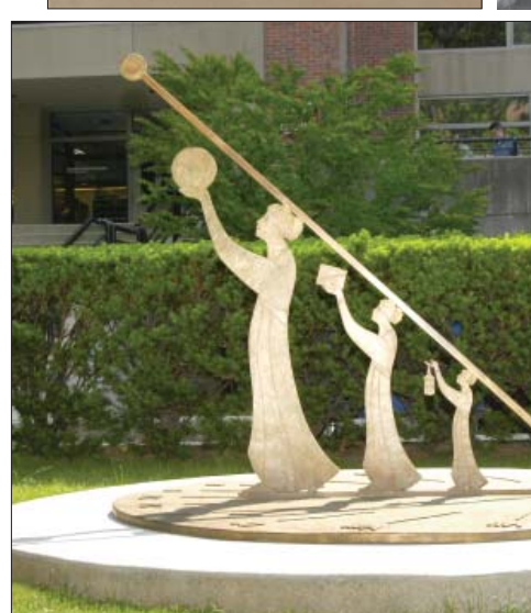
Page 6— Caring Headlines — November 6, 2014