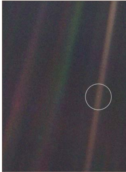
Earth, as seen from 6 billion kilometers, appears as a pale blue dot in the vast darkness of space.

kindly with one another.” And when it comes to understanding and working through our differences, please, let us all add our voices to that conversation.