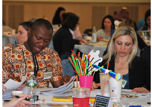
Four nursing preceptor education programs have provided targeted education to more than 700 learners from hospitals and healthcare organizations throughout Maine. The 5th program will be held this spring. For information, go to: www.lunderdineen.org/preceptorship.

The MOTIVATE program has been implemented throughout the Maine veterans' long-term care system. A key component of the program is the educational webinar, Tools of the Trade: Steps in Providing Oral Health Care , which provides critical information about best practices in maintaining good oral health. Check out the webinar at: www.lunderdineen.org/motivate-oral-health-resources, and log in with username: motivate; password: module.