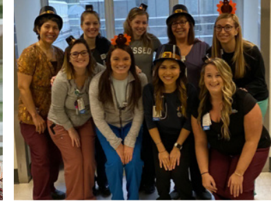
(At left): White 8 Medical Unit observes Thanksgiving with decorative hats and a fun-loving attitude.