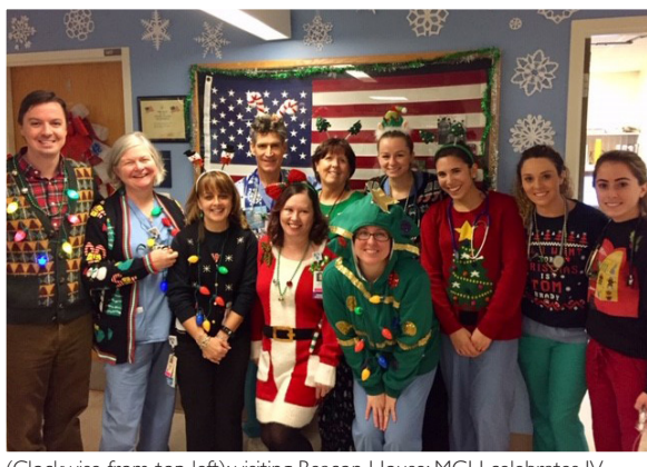
(Clockwise from top left): visiting Beacon House; MGH celebrates IV Nurse Day; a visit to Bigelow I4 Vascular Unit; and the Blake I2 ICU.