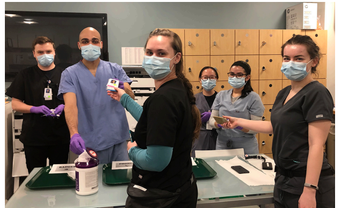
PT aides clean ID badges, Voalte phones, personal phones, and common areas to preserve PPE and keep the area COVID-free.