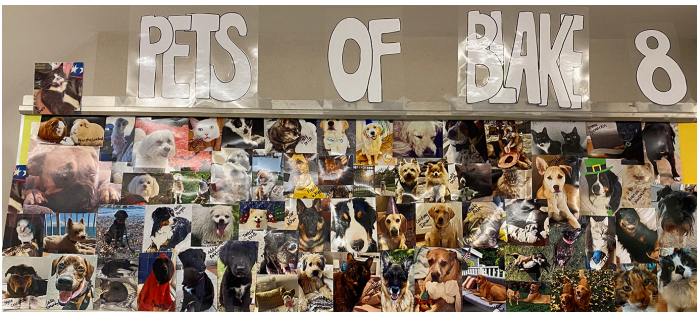
Staff of the Blake 8 Cardiac Surgical ICU are keeping their spirits up by virtually bringing their pets to work.