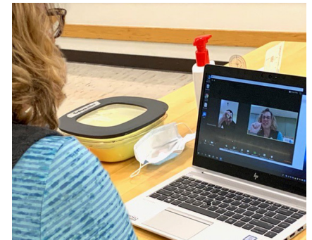
(At left): the inpatient Occupational Therapy team. These therapists are providing needed rehabilitation to COVID-19 patients, helping them re-gain strength and function in preparation for discharge.