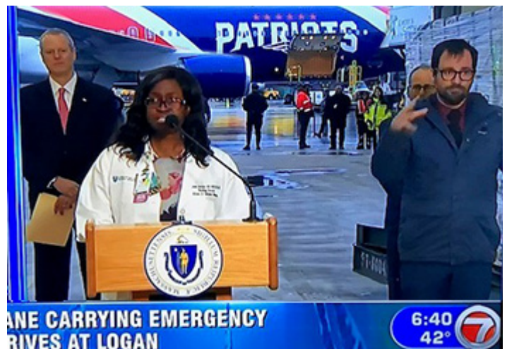
PLANE CARRYING EMERGENCY RIVES AT LOGAN