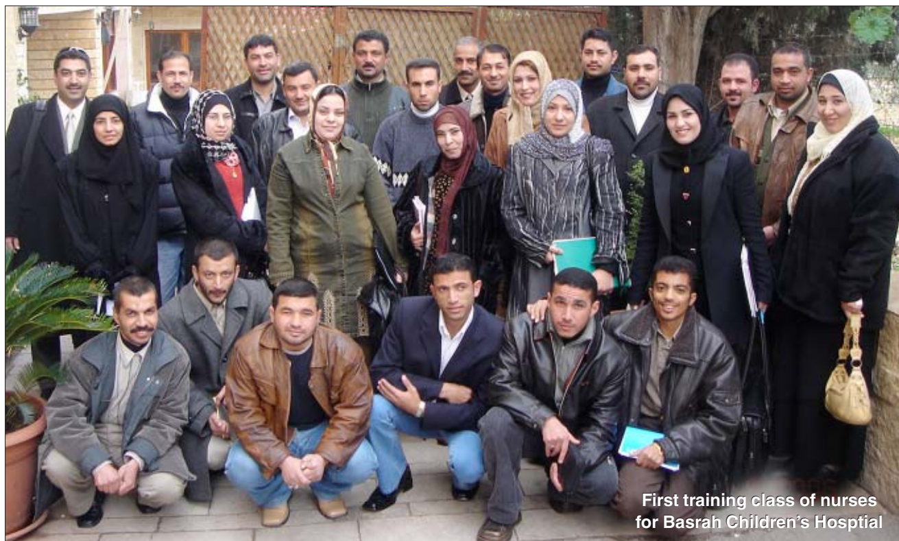
First training class of nurses for Basrah Children's Hospital