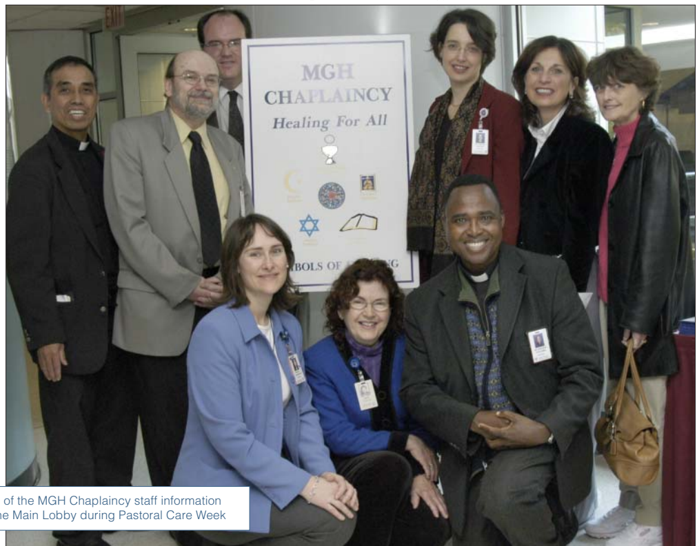
Members of the MGH Chaplaincy staff information booth in the Main Lobby during Pastoral Care Week

On October 26, the annual Blessing of the Hands was held outside the MGH Chapel, affirming the many tasks our hands perform to provide comfort and care to others. For more information about the MGH Chaplaincy, call 617-726-2220.