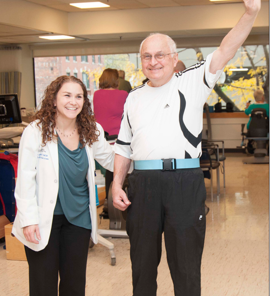
Celebrating Physical Therapy Month at MGH #Get PT 1st